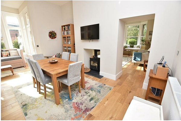
LIVING KITCHEN DINER