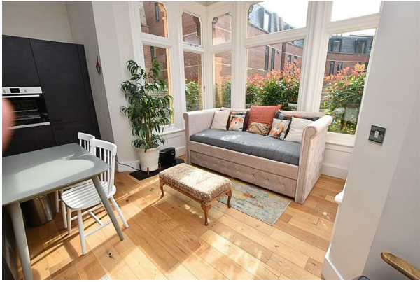
LIVING ROOM 20'4" into bay x 15'10" (6.22 into bay x 4.83)